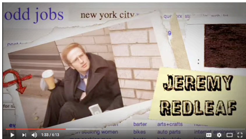
Odd Job Nation: http://youtu.be/JW1p09qxaAY