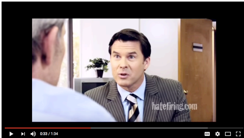
Hate Firing: http://youtube.com/user/hatefiring/videos?sort=p&flow=list&view=0