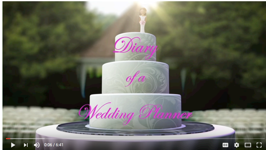
Diary of a Wedding Planner: http://youtube.com/watch?v=J3TOkPZ2cx4