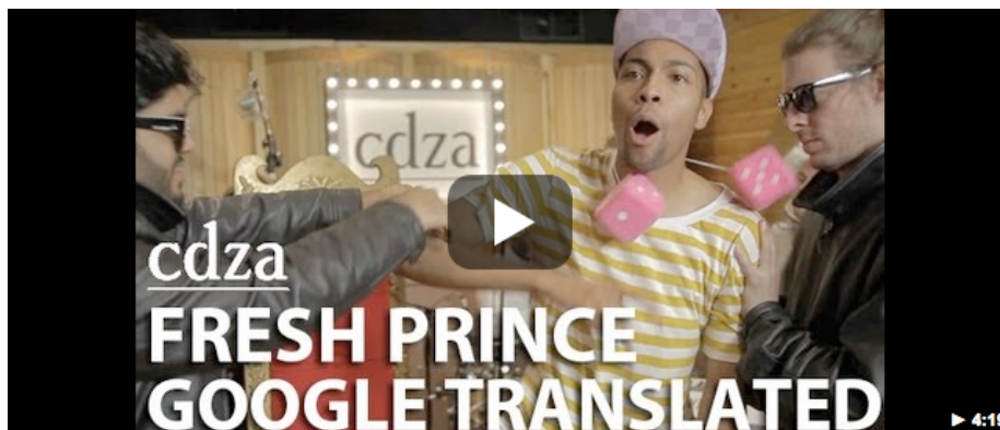
Fresh Prince: Google Translated: http://youtube.com/watch?v=LMkJuDVJdTW